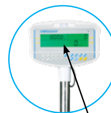
Bright backlit display